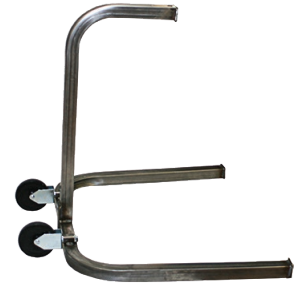
PS Portable Stroller 161 lbs (w/ fan)