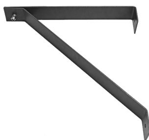
CW Column-Wall 55 lbs (w/ fan)