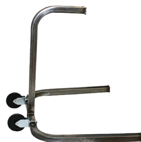
PS Portable Stroller 78 lbs (w/ fan)