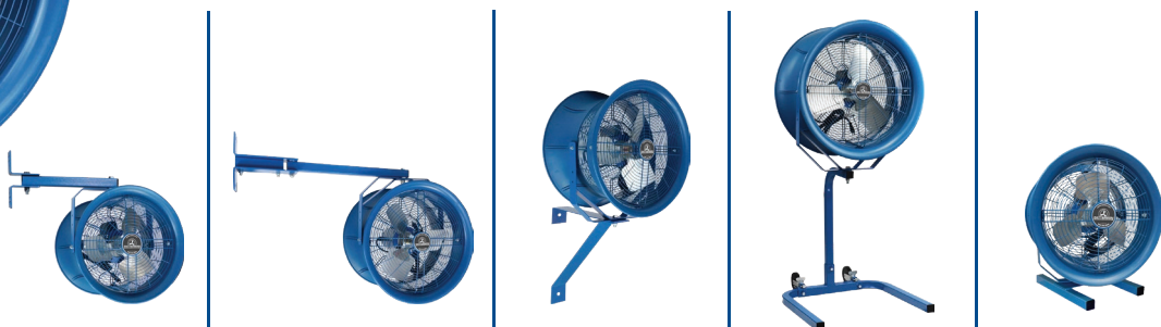
RM Rack Mount TC Truck Cooler CW Column-Wall PS Portable Stroller PB Pedestal Base