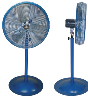
PB Pedestal Base Adjustable height: 42-72" 33" closed base